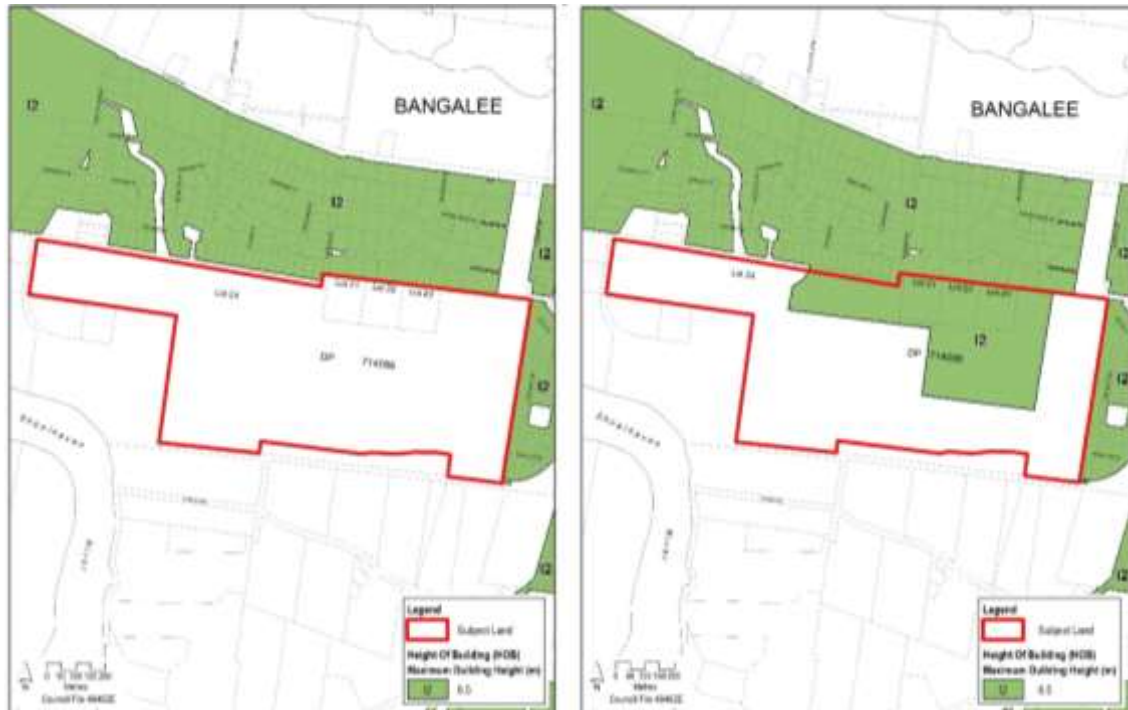
Figure 6 – Existing (LHS) and proposed (RHS) height of buildings (HOB) under SLEP 2014