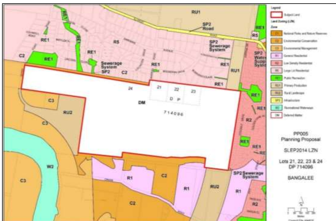
Figure 2 – Shoalhaven LEP 2014 (Note: subject land is currently deferred from SLEP 2014)

The zoning of the subject land was 'deferred' from Shoalhaven LEP 2014 and therefore the provisions of Shoalhaven LEP 1985 continue to apply. Under Shoalhaven LEP 1985, the site is currently zoned Rural 1(d) (General Rural).