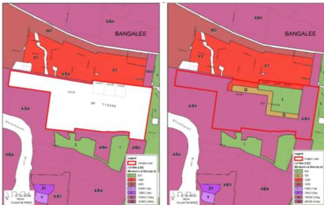
Figure 5 – Existing (LHS) and proposed (RHS) minimum lot size (LSZ) under SLEP 2014