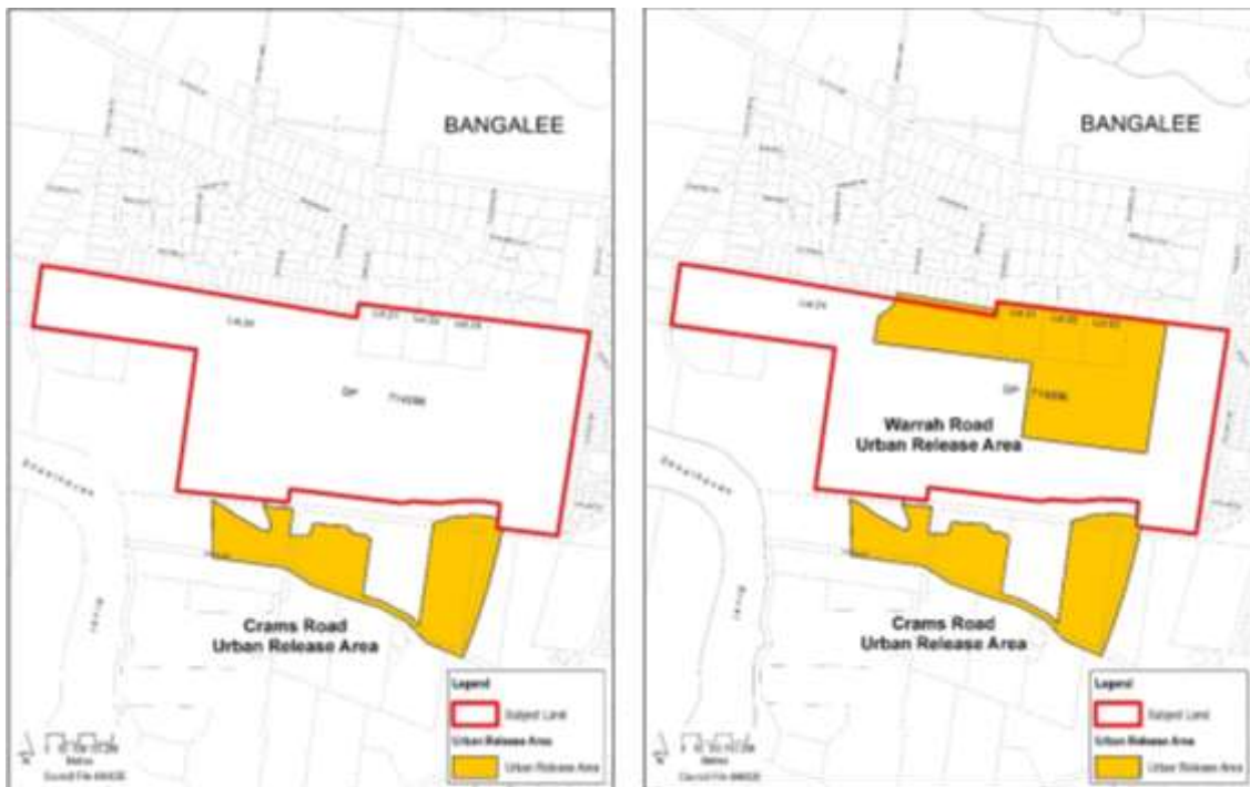
Figure 7 – Existing (LHS) and proposed (RHS) urban release area (URA) under SLEP 2014

If supported, the revised proposal does, however, need to be re-exhibited due to the extent and nature of changes.