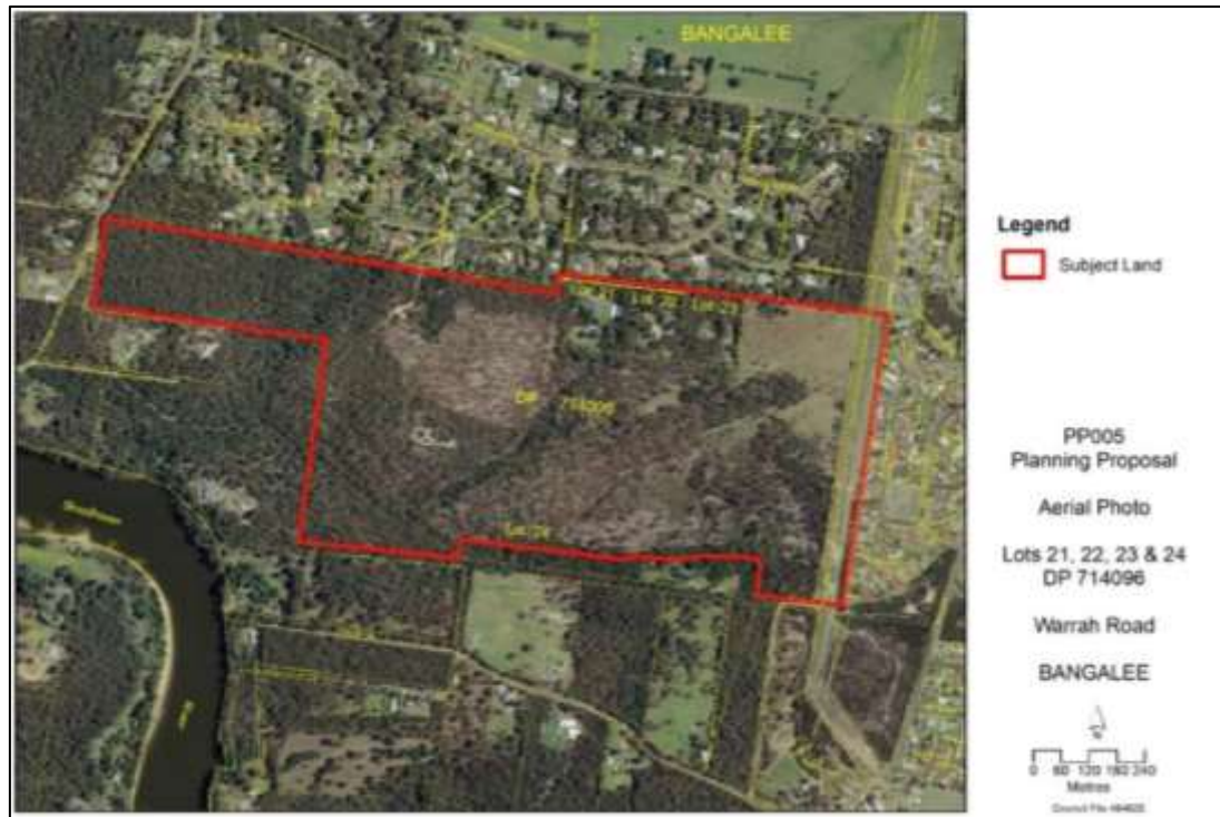
Figure 1 – Aerial Photo and boundaries of Subject Land

The subject land is bordered by existing land zoned R5 Large Lot Residential to the north, R2 Low Density Residential to the east and small rural holdings zoned C2 - Environmental Conservation and C3 - Environmental Management to the south and west. The remaining part of the original Crams Road URA zoned R1 (General Residential) adjoins the land to the south separated by a Crown Road (see Figure 2 ).